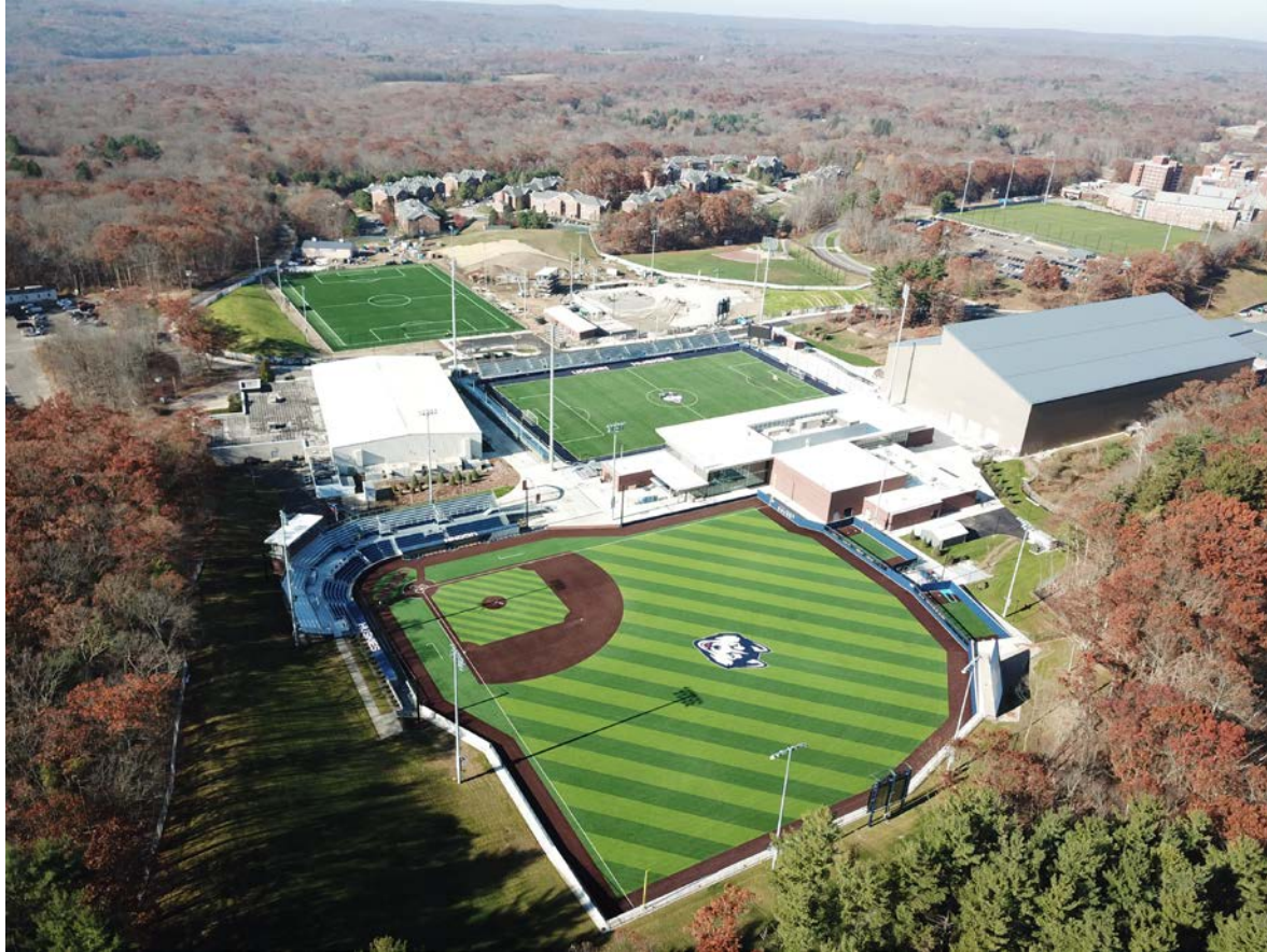
Aerial View of Complex Looking Northwest