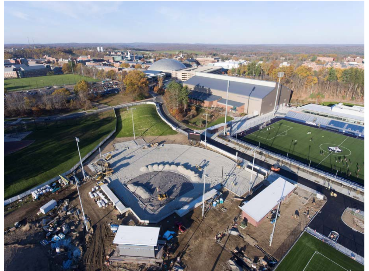
Aerial View of Softball Field Looking North