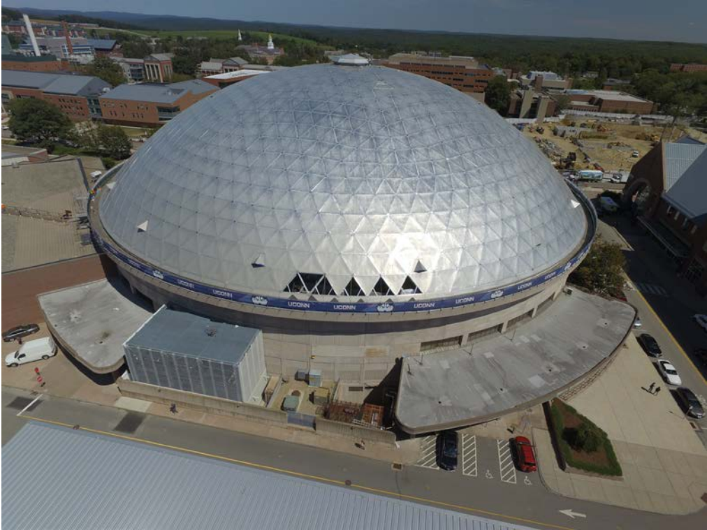
Aerial View of Gampel Looking West