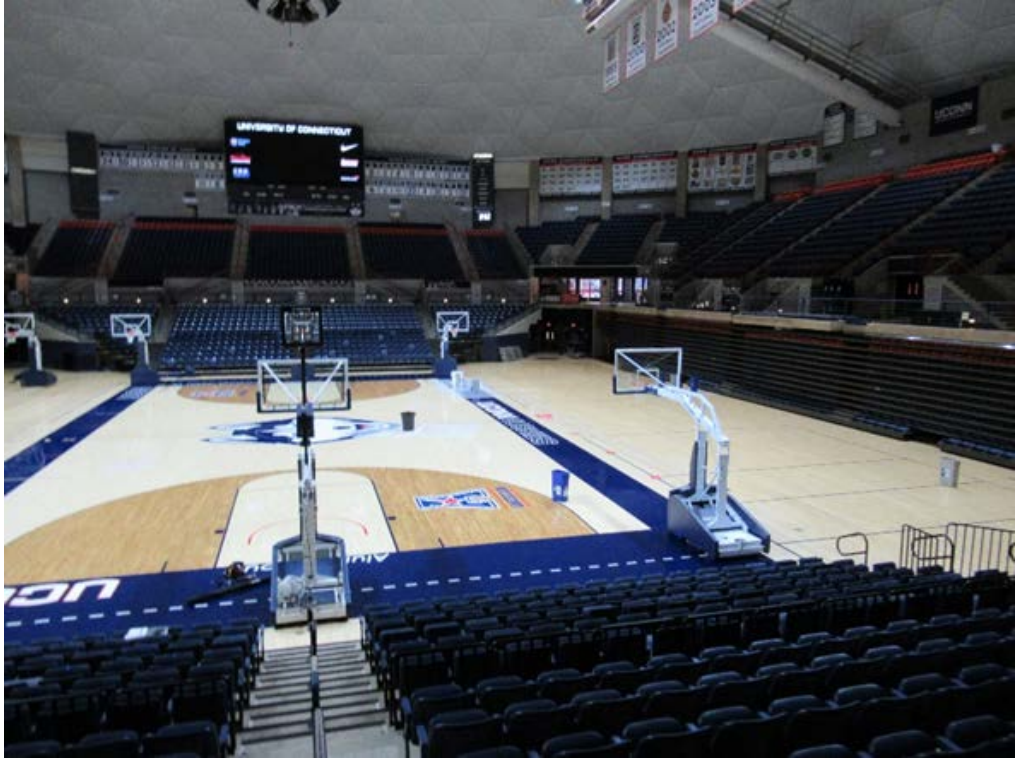
View of installation of refinished Court and Ceiling Panels