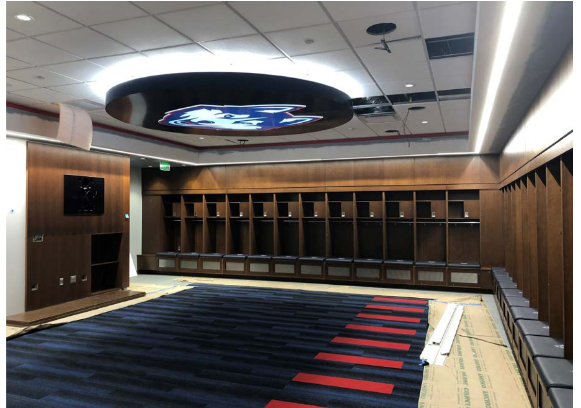
View of Women's Soccer Locker Room in the Performance Center