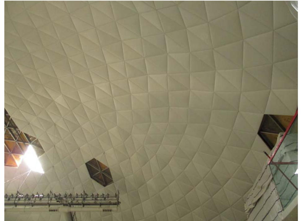
Progress of New Panel Replacement and Installation