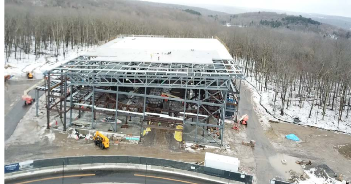
North Elevation Looking South